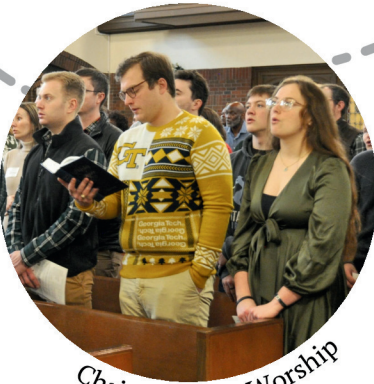
Christmas Eve Worship

Parents with children ages birth through middle school gather each Sunday for Parent Oasis, a time of Bible study, teaching, discussion, and fellowship. Last year the Parent Oasis class studied Proverbs, gaining insight and inspiration on the essential roles of parents.