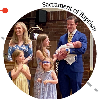
Sacrament of Baptism