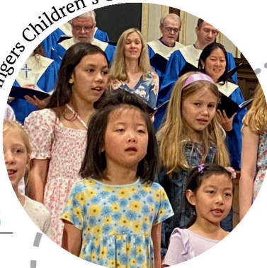
Alleluia Singers Children's Choir