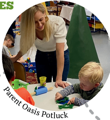
Parent Oasis Potluck

From infant through 8th grades, age-appropriate classes help children build a lifelong relationship with Jesus. This year, children looked at God's workings in the lives of His people, from the exile of the Jews through the start of the Christian Church.