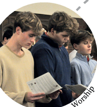
Christmas Eve Worship