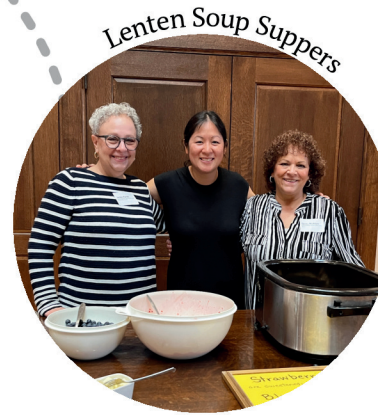
Lenten Soup Suppers

Last year, we learned ways to keep scripture in our hearts, looked at biblical views of life transitions, learned how to live out our core beliefs as a church, looked at various aspects of biblical hope, Hesus in the Bible, hell in the Bible, and learned about our various mission partners' work around the world.