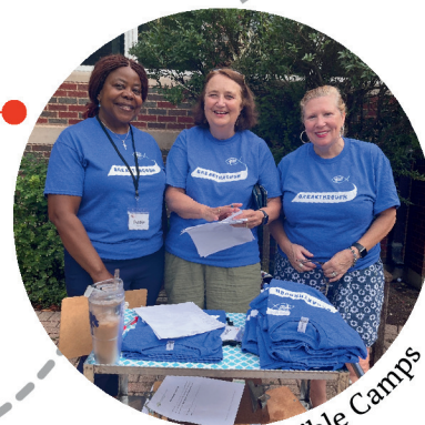
Summer Bible Camps